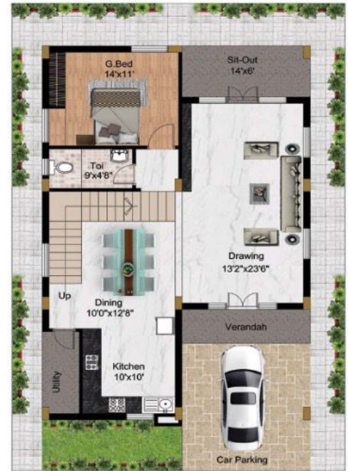
GROUND FLOOR 40 FEET WIDE ROAD