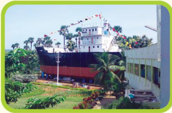
Ship in Campus