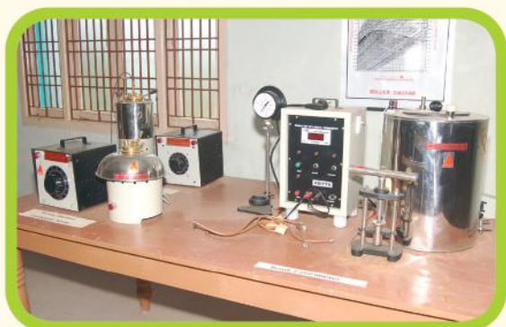
Fuel Testing Lab