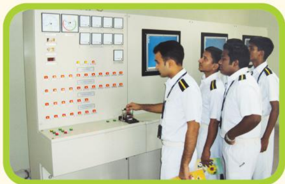
Engine Room Simulator