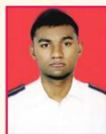
A SAI TEJA 14EL0179 SEA TRADING SERVICES AND SHIP MANAGEMENT PVT.LTD