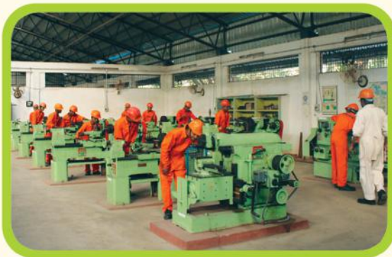
Lathe Machine Shop