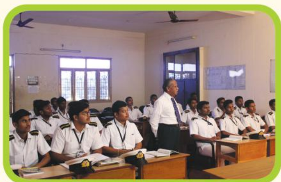
A/c Class Room